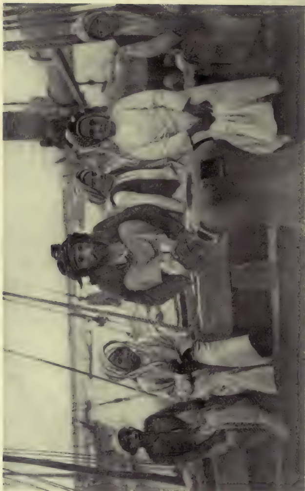
A NAKHODA (CAPTAIN) AND HIS FAMILY.